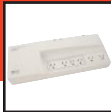
NEW! PATRIOT 250VA