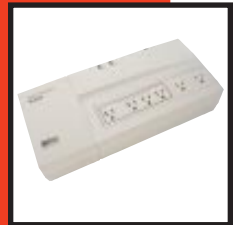
NEW! PATRIOT 425VA and 600VA